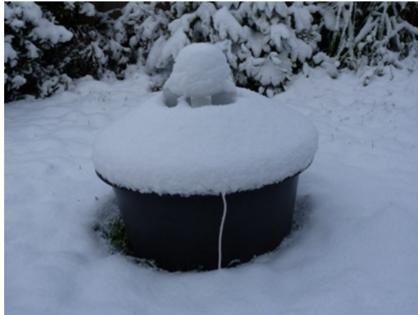
Moth trap, Broadwey 2 December 2010