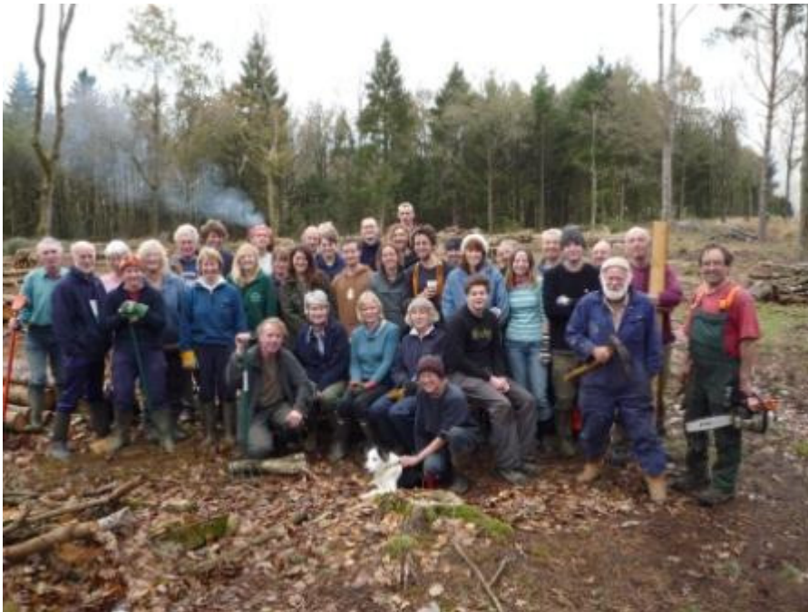
Alners Gorse work party, 13 November 2010

By day, a Hummingbird Hawk-moth flew out of garden shed at Portesham (C Whitby per P Harris). At Portland, three Rusty-dot Pearl and a Silver Y (PBO website). Just a handful of moths at Broadwey, two Red-green Carpet , Feathered Thorn , Brick and Beaded Chestnut (P Harris). At Durlston, Swanage, two Light Brown Apple Moth , four Red-green Carpet , a Large Yellow Underwing , Blair's Shoulder-knot , five Yellow-line Quaker , two Beaded Chestnut and an Angle Shades (P England). A Diurnea lipsiella was new for the garden at Alderholt (T Morris).