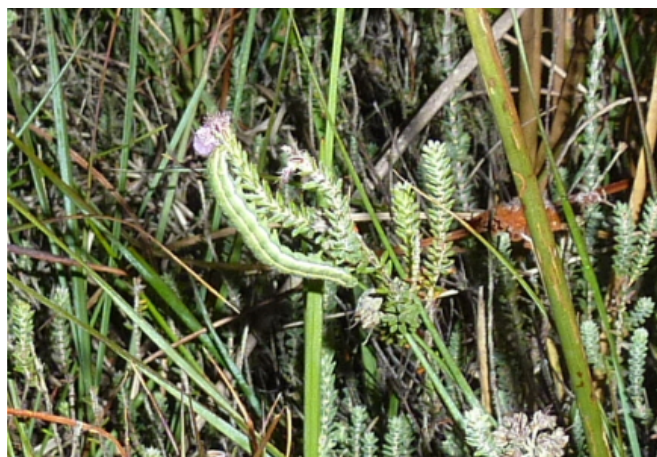
Shoulder-striped Clover larva, Holt Heath, 24 August 2010